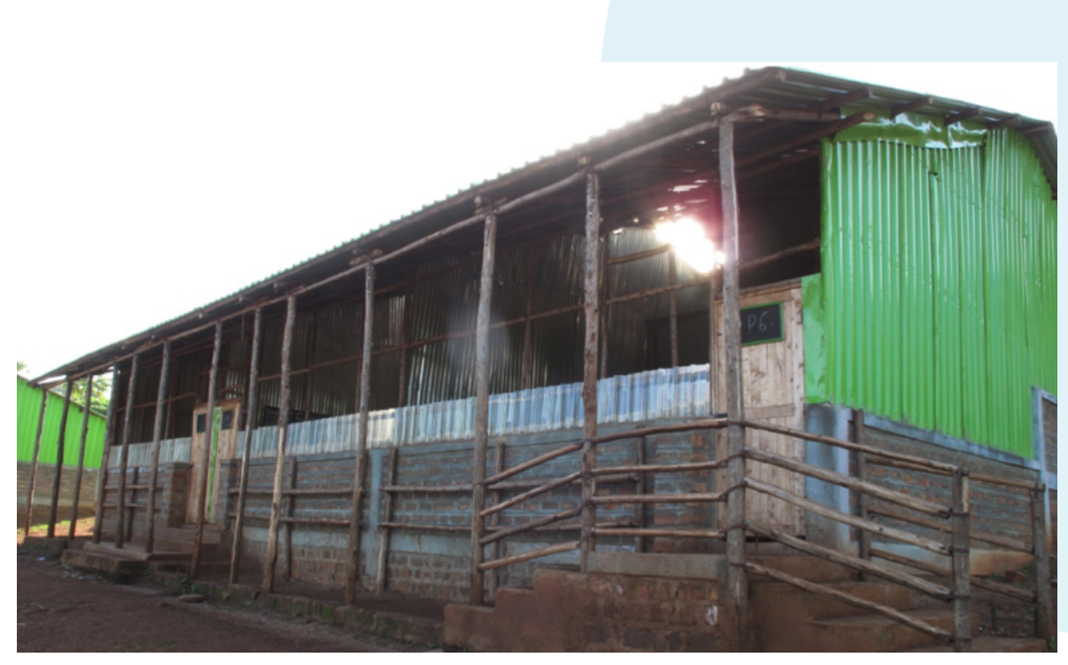
Figure 3: Bridge International Academy, 6-classroom structure in Eastern, Uganda.

Cost-cutting techniques employed by Bridge are purportedly designed to make the company's educational services 'affordable' for youth in Uganda living in poverty. Although fees charged by Bridge can vary slightly from one branch to another, the table below shows the typical costs a customer in Uganda would expect to pay.