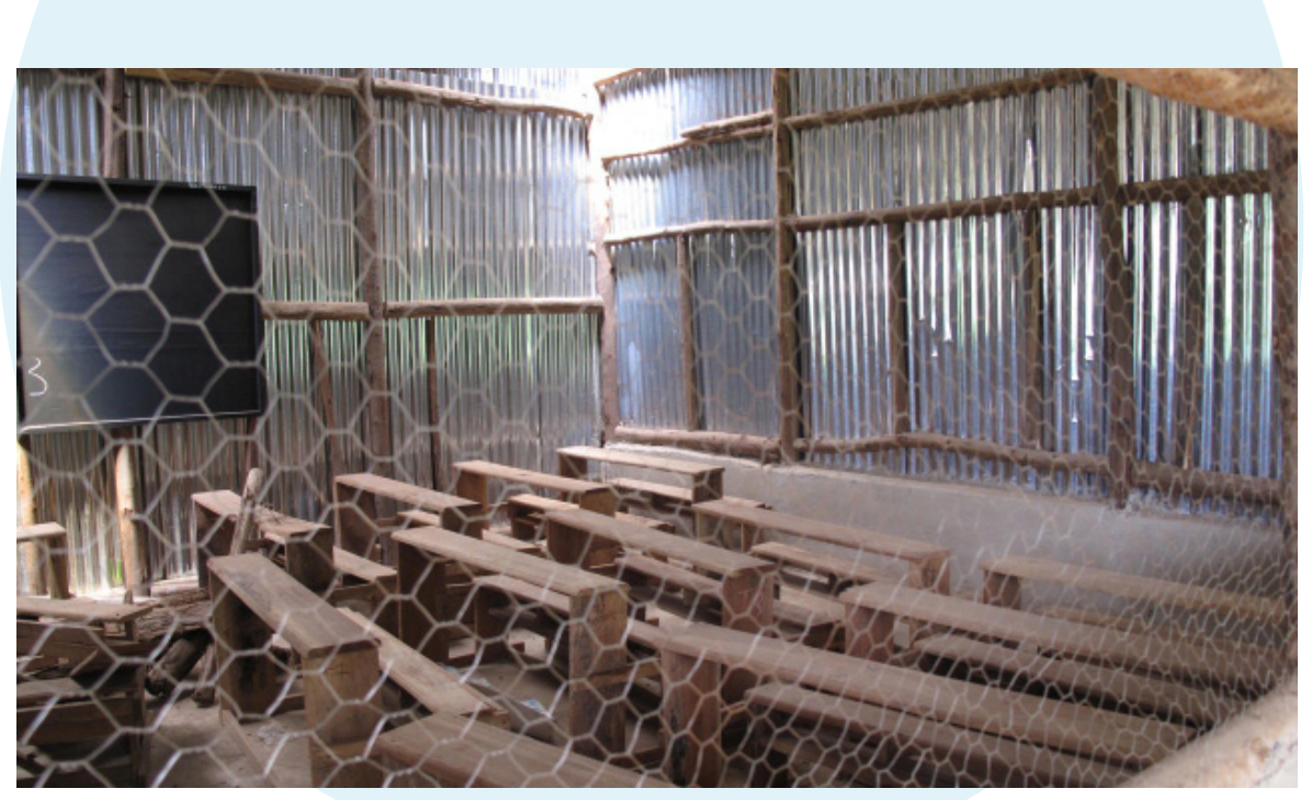
Figure 2: A typical Bridge International Academy classroom in Eastern, Uganda.

The physical appearance of each Bridge classroom represents not only the standardised academy-in-a-box model but also the profit motivation behind cutting costs in relation to school construction.