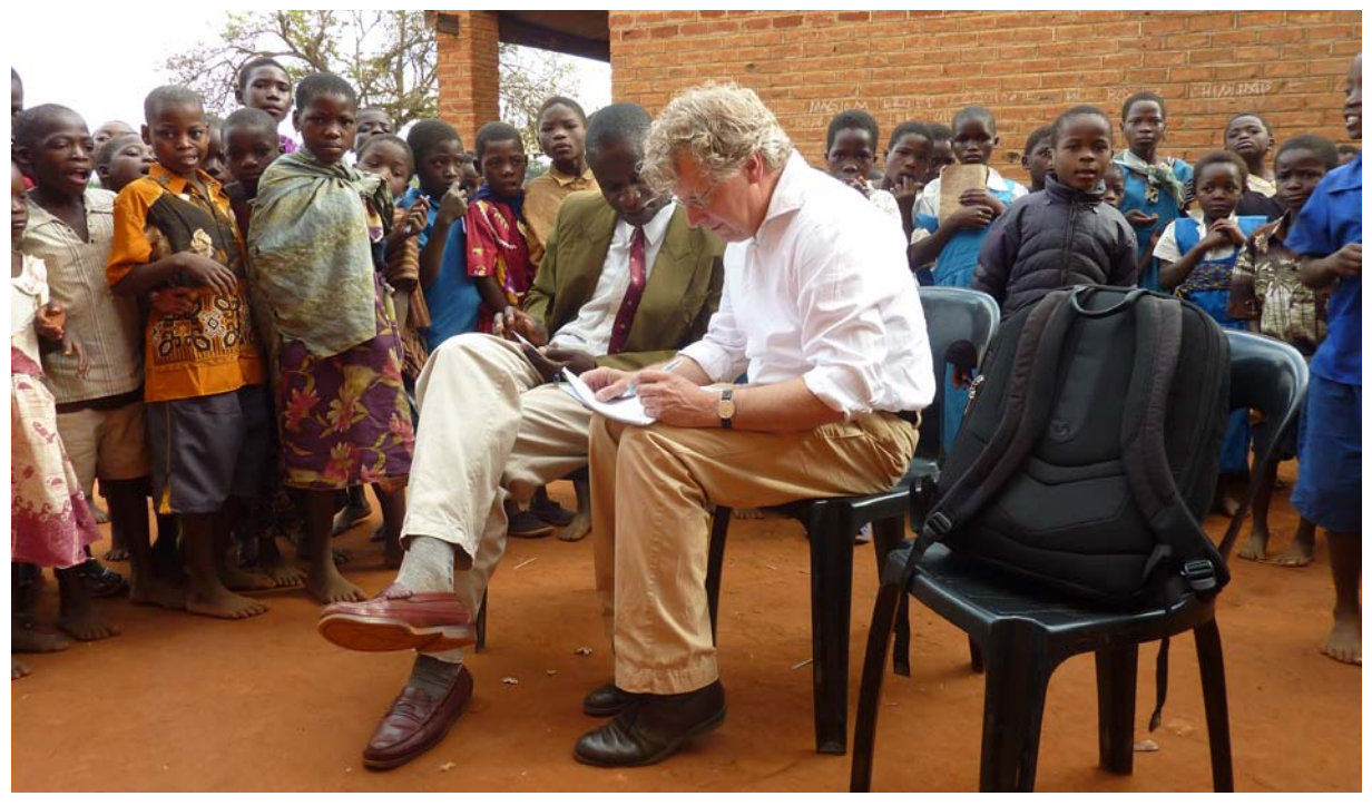
Plate 9: Interview at Magomero Primary School, rural Dedza, Malawi