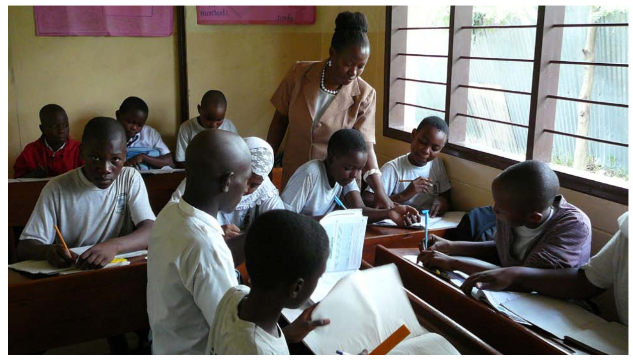
Plate 4: Boma Primary School, Dar es Salaam, Tanzania