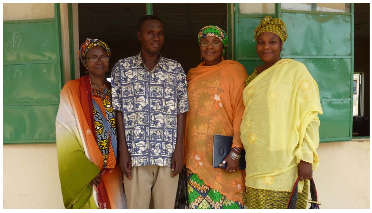
Plate 7: STUP tutors, Zaria, Nigeria