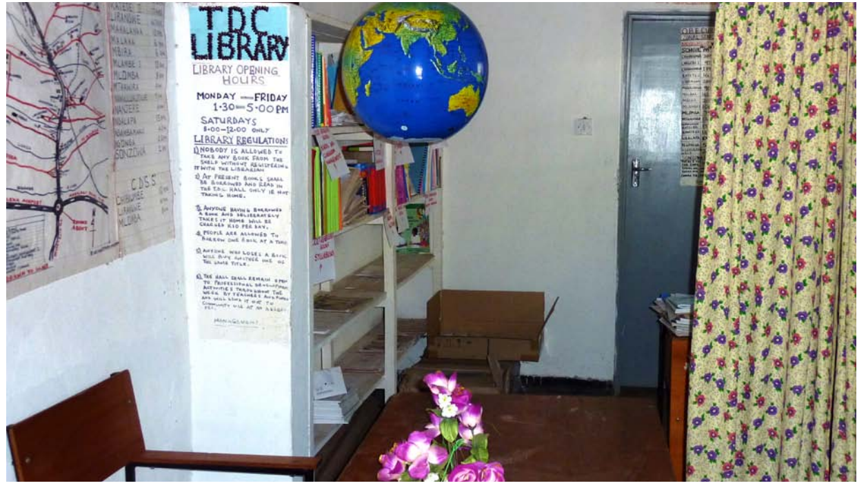
Plate 10: Library at Teacher Development Centre, Lirangwe, Malawi