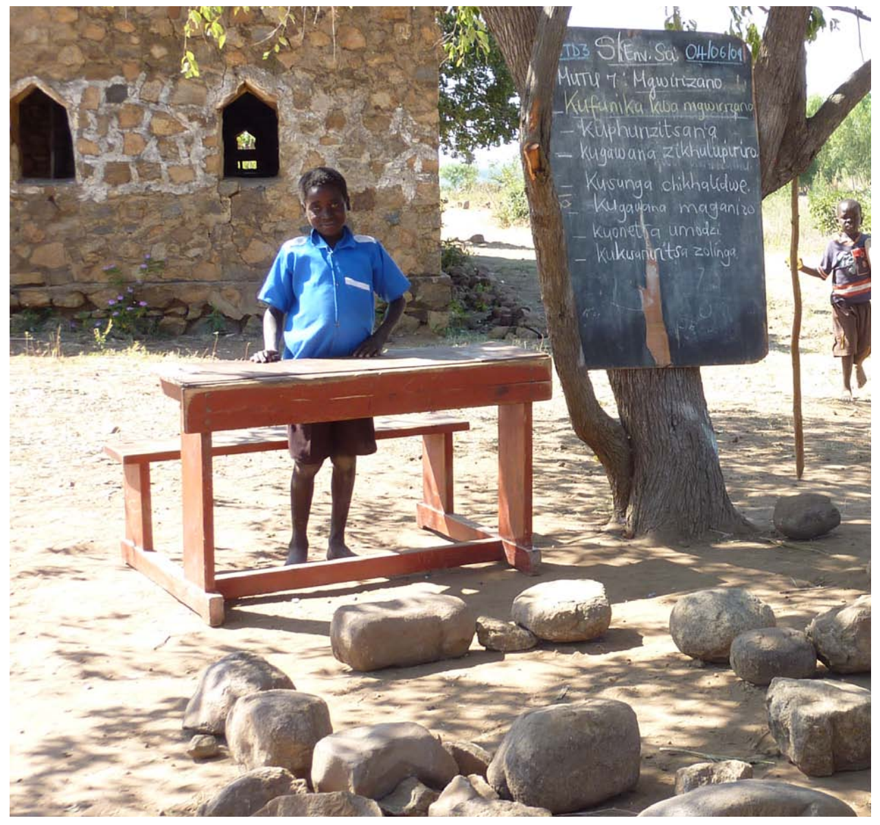
Plate 3: Makalanga Primary School, Malawi