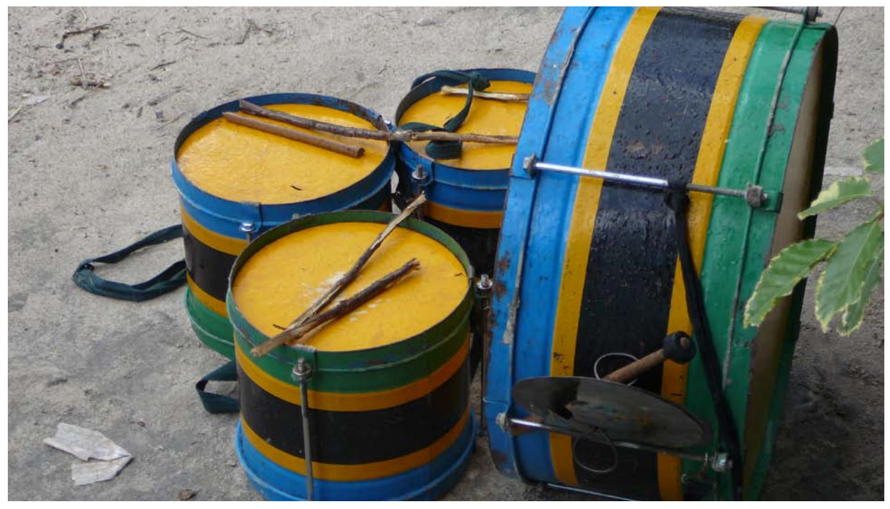
Plate 2: Mwarusembe Primary School, Tanzania