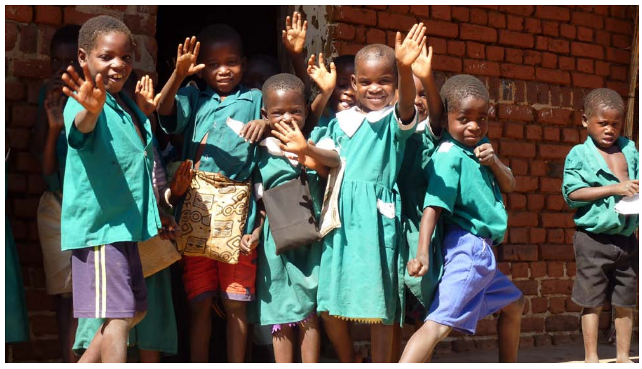
Plate 5: Mlambe 1 Primary School, Malawi