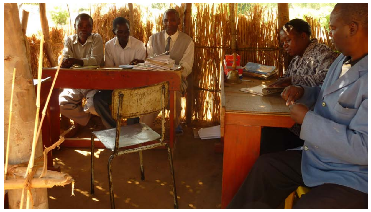
Plate 8: Interview at Makalanga Primary School, Malawi